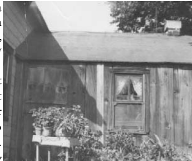
Townsend House, Concord, MA