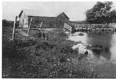
Townsend Mill, Canton, MA