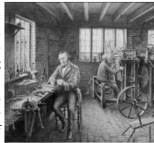
Matthew's Workshop, Leicester